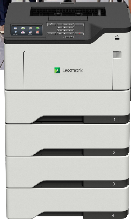
MS622de with optional trays